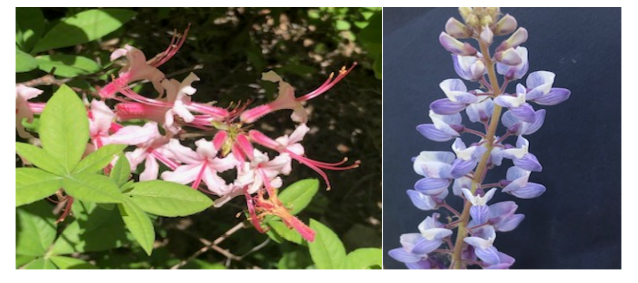
Mountain azalea Lupine