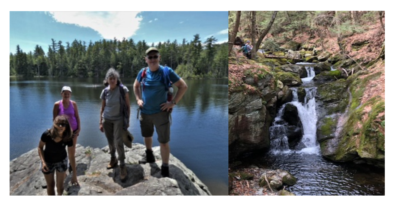
Group at Pole Hill Pond