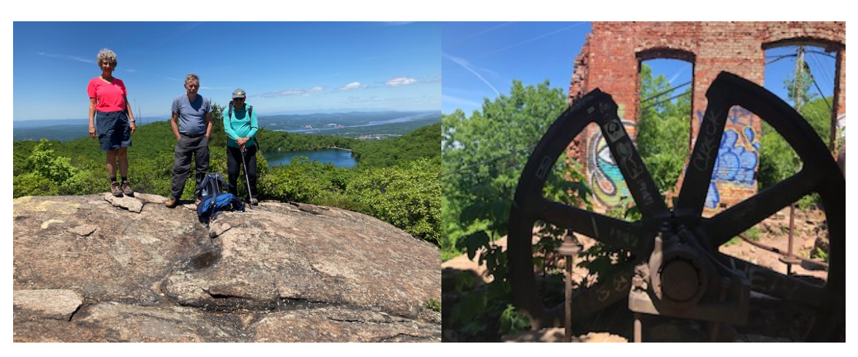
On top of Mount Beacon