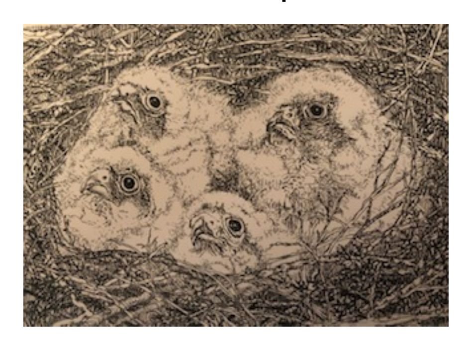
Published by The Albany Chapter of the Adirondack Mountain Club