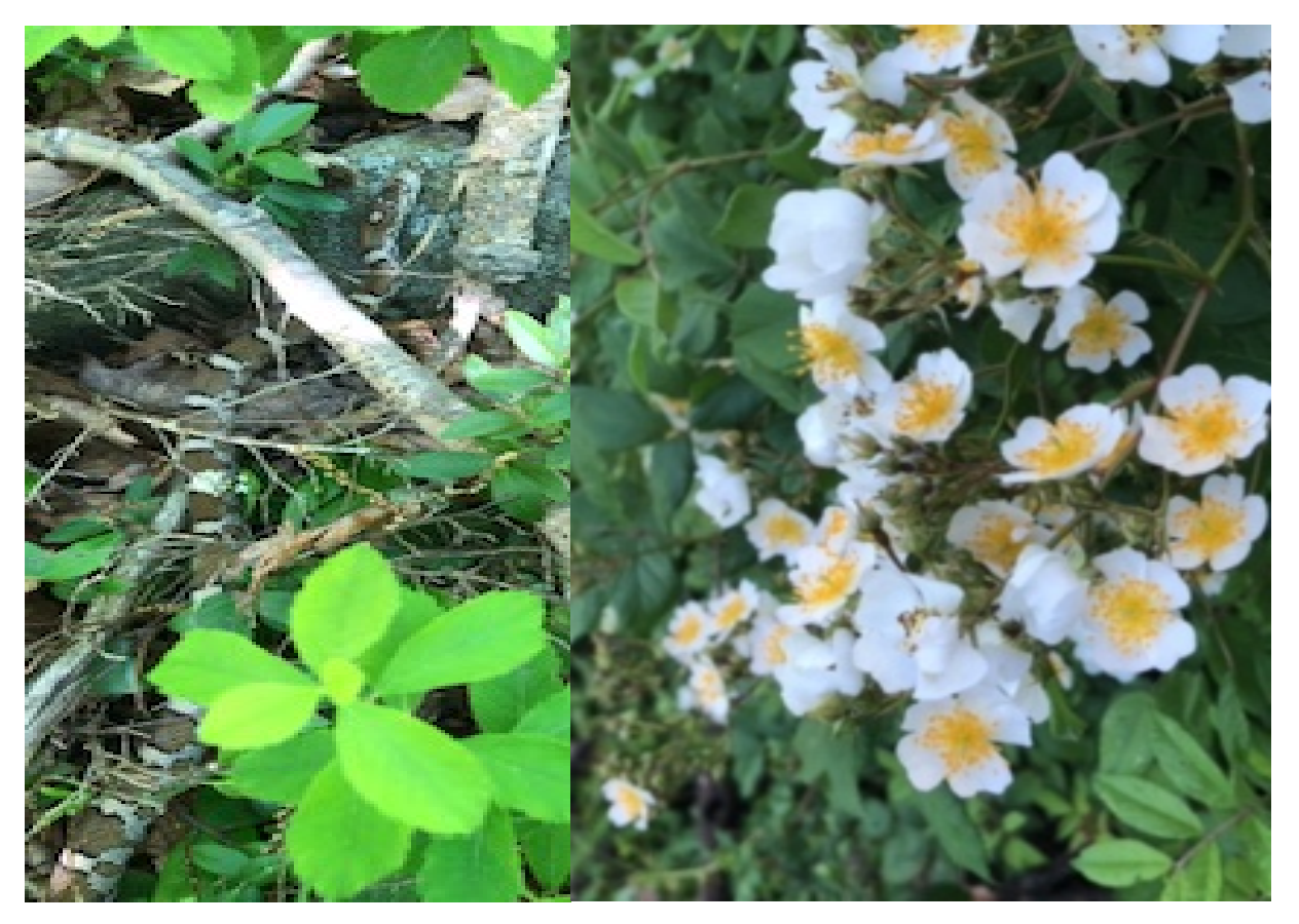
Milk snake Wild roses